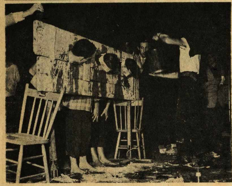
ARD FROSH, who drew down the wrath of the sophomores during Initiation Week, are shown above receiving the punishments which the High Court of Sophomores deemed suitable to the crime committed. Regrets and apologies for the crimes were of no avail. Whatever sticky stuff is being applied, you can bet it took considerable effort to