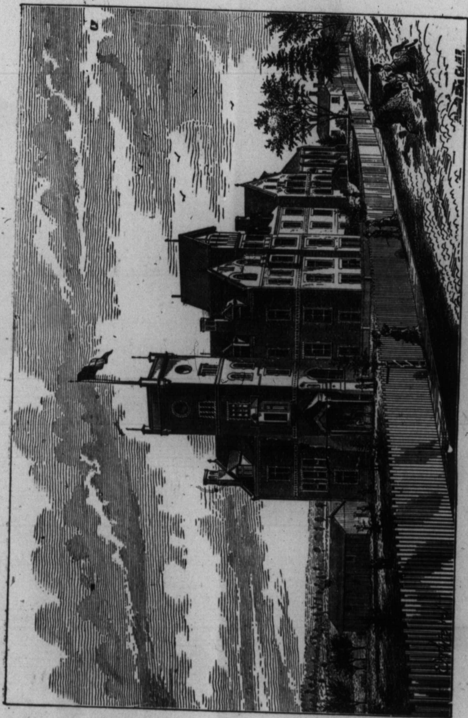
TRINITY COLLEGE SCHOOL, PORT HOPE.