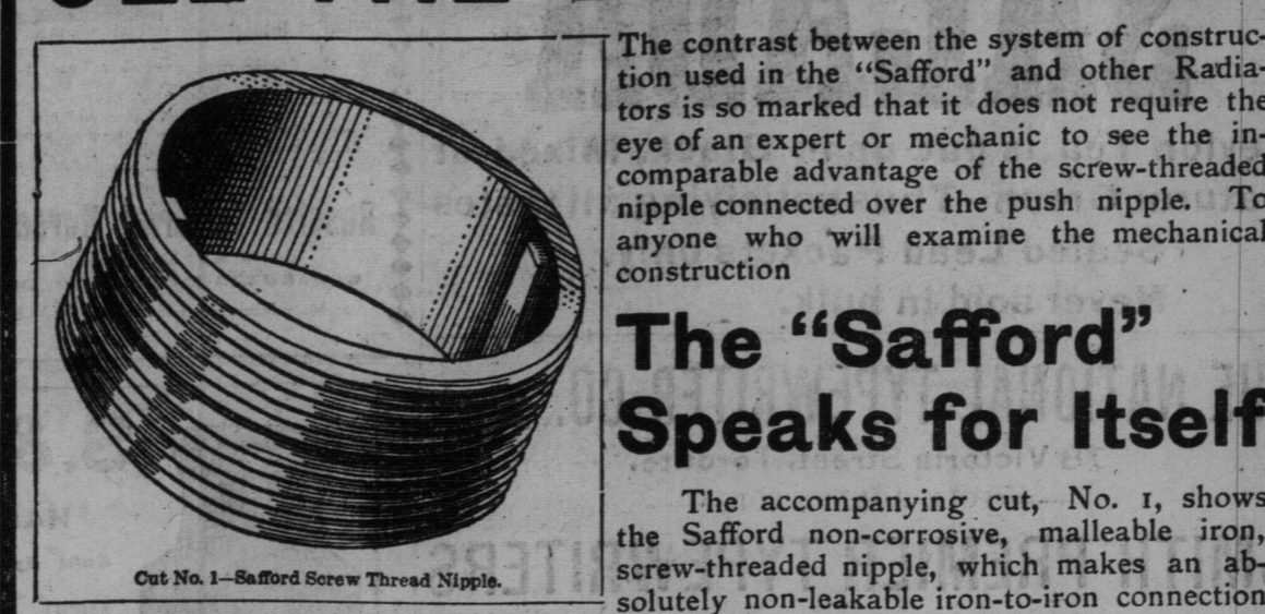
Cut No. 1—Safford Screw Thread Nipple.

The contrast between the system of construction used in the "Safford" and other Radiators is so marked that it does not require the eye of an expert or mechanic to see the incomparable advantage of the screw-threaded nipple connected over the push nipple. To anyone who will examine the mechanical construction