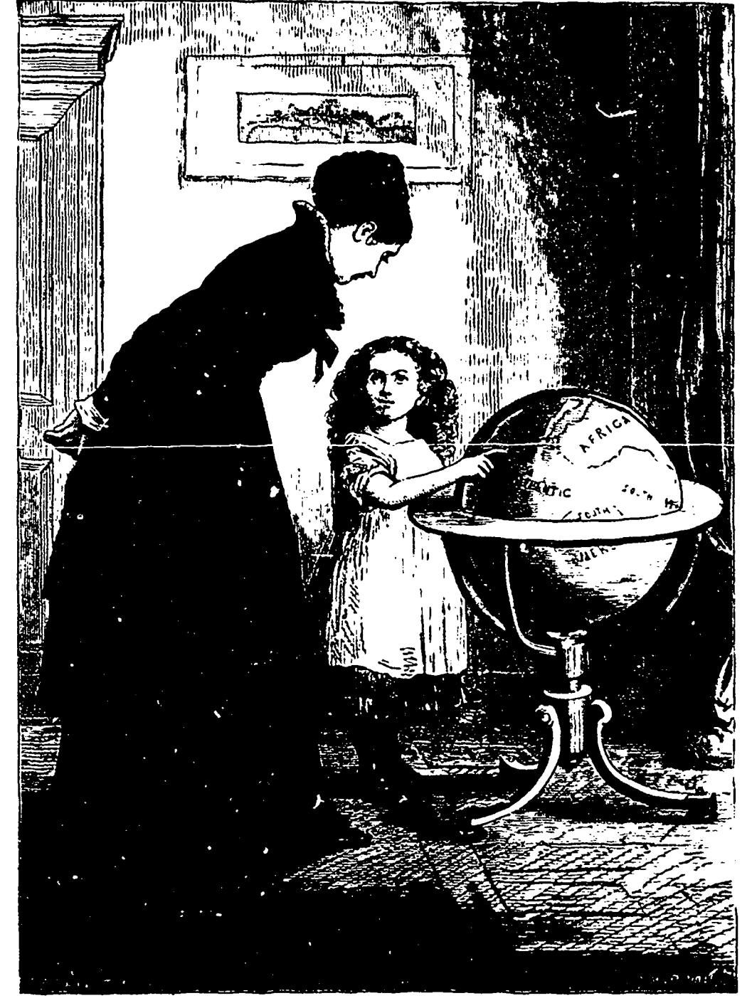
A FIRST LESSON.

rise into the air. and so quick arouts jumps. It can run as will as jump. and this it does with great speed