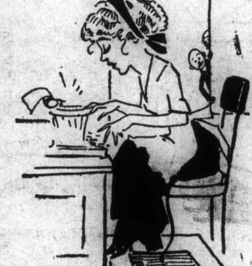
A MISTAKE. "Men who marry their stenographers make one fatal mistake." "What is that?" "They think the force of habit will make their wives take dictation."