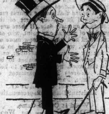
SAME SENSATION "When I visit the Grand Canon of the Yellowstone I realize the insignificance of man. Ever been there?" "Never. You can get the same sensation by going to a suffragette meeting."