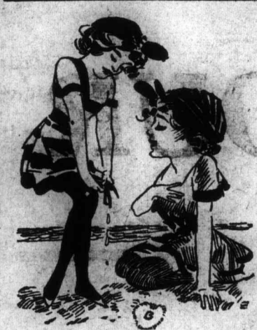
COULDN'T POOL HUBBY "What's the matter with him?" "I can't get him to give his attention to the tariff bill and not bother about the amount of my bills."