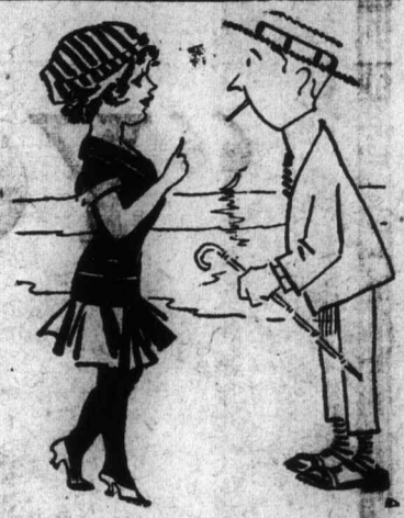
SAW HIM FAN THE AIR "My husband isn't a public-spirit ed man." "What's the matter with him?" "I can't get him to give his attention to the tariff bill and not bother about the amount of my bills."