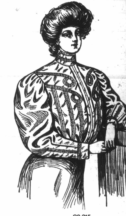
Q2-215—Women's Waist, of Louisine silk, black, white, navy and sky, tucked back, boxpleated front, made with clusters of fine tucks, and trimmed with lace insertion in scroll design, new tucked sleeve, made with deep cuff effect, collar and cuffs finished with insertion, special. $3.50