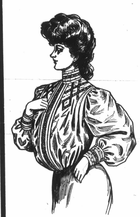
Q2-200—Women's Jap Silk Waist, made with box pleat and tucks, back and front trimmed with open Valenciennes $2.75