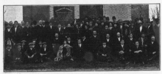
GALT DISTRICT CONVENTION AT ELMIRA.

"As far as my records show, London Conference has eleven organized Districts, of which nine have held conventions up to the time of writing (Dec. 12). If 1 cite Chatham as a sample of these, it is because I was present and know that the writer of the following summary of the Convention gave a correct synopsis of its character. The acting Secretary wrote of this gathering at Dresden: "The attendance was large, there being an excellent representation from all the Leagues in the District.