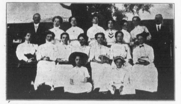
ONE OF THE STUDY CLASSES AT WELLINGTON SUMMER SCHOOL, 1911. (See p. 23.)

service:--Gentleness, Trust, Kindness, Obedience, Humility, Love,-showing how by these we may possess the true spirit of service as taught by Jesus. The Influence of the love of Christ in our hearts and its effect upon our lives might be explained by the Superintendmight be explained by the Superintend-ent by means of candles. First, show them unlighted and talk about their possible varied use. Light one with a match. Show the difference yet the similarity between them. Then light the second from the first, showing the effect of holy influence. If Christ's love be in our hearts we may lighten some part of the world which would be all dark without its shining.