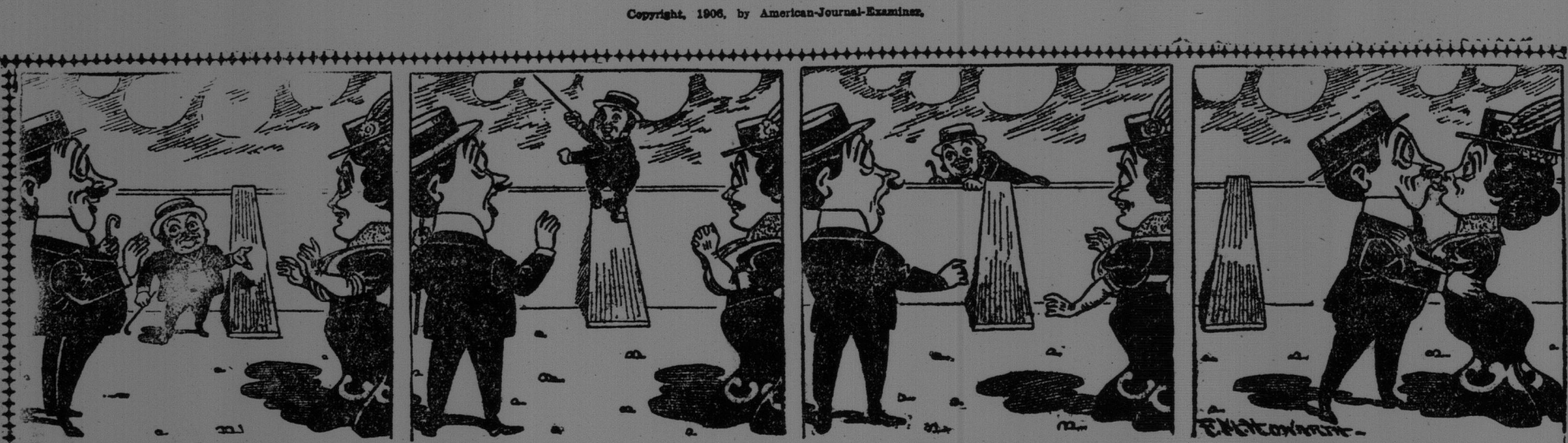
4. GERTIE—Yes, dear; popper has got to go all the way around the block to get in at the front door.