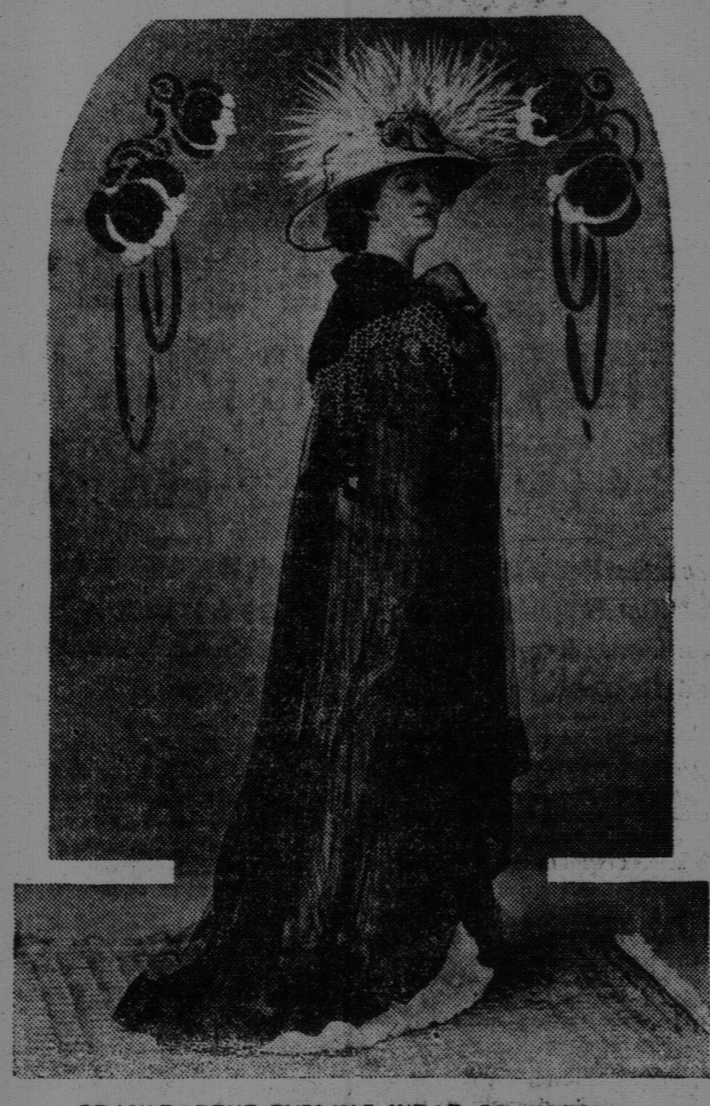
TRANSPARENT EVENING WRAP OF CHIFFON. These airy wraps will be worn over bare arms and shoulders this winter, but the wraps are really only meant for decoration and not for use, a warm fur garment being donned over the filmy wrap even in carriage or limousine. The chiffon wrap is thrown over the shoulders in the opera foyer and makes a charming veil over a lovely gown. This wrap is of blue chiffon with a border trimming of heavy lace dyed to match. The cape is of blue velvet edged with a wandyked trimming of silver net.

George Trevor had not mentioned the nature of the securities he had deposited that day, and, too, he thought that he now saw a way out of his dilemma, for the partnership agreement was in his pocket, and he was positive that he could induce Trevor to accept the aid of the young financier. This done, surely he could so direct matters that there need be no fear lest his crime be exposed.