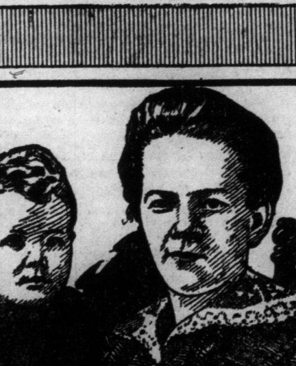
Dr. Chase's Nerve Food advertisement text.