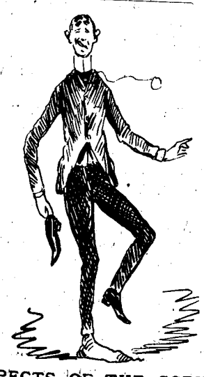
"THE PROSPECTS OF THE CORN CROP ARE GOOD!" -Daily Paper.

GREAT is GRIP, as undoubtedly will be readily acknowledged on all sides and by all parties. His cartoons, "History repeats itself," "Ottawa bull fight," "Latest fashion in hats," "The popular idea," "Prohibition," "The political incubators," and a number of other equally clever hits on living issues and passing events, are samples of originality of thought unsurpassed by any caricaturist of this or any age that we know of. And better still, there is a constantly increasing improvement in almost every issue, all crowned by independence as to whose ox is gored.—Algoma Pioneer, Sept. 10