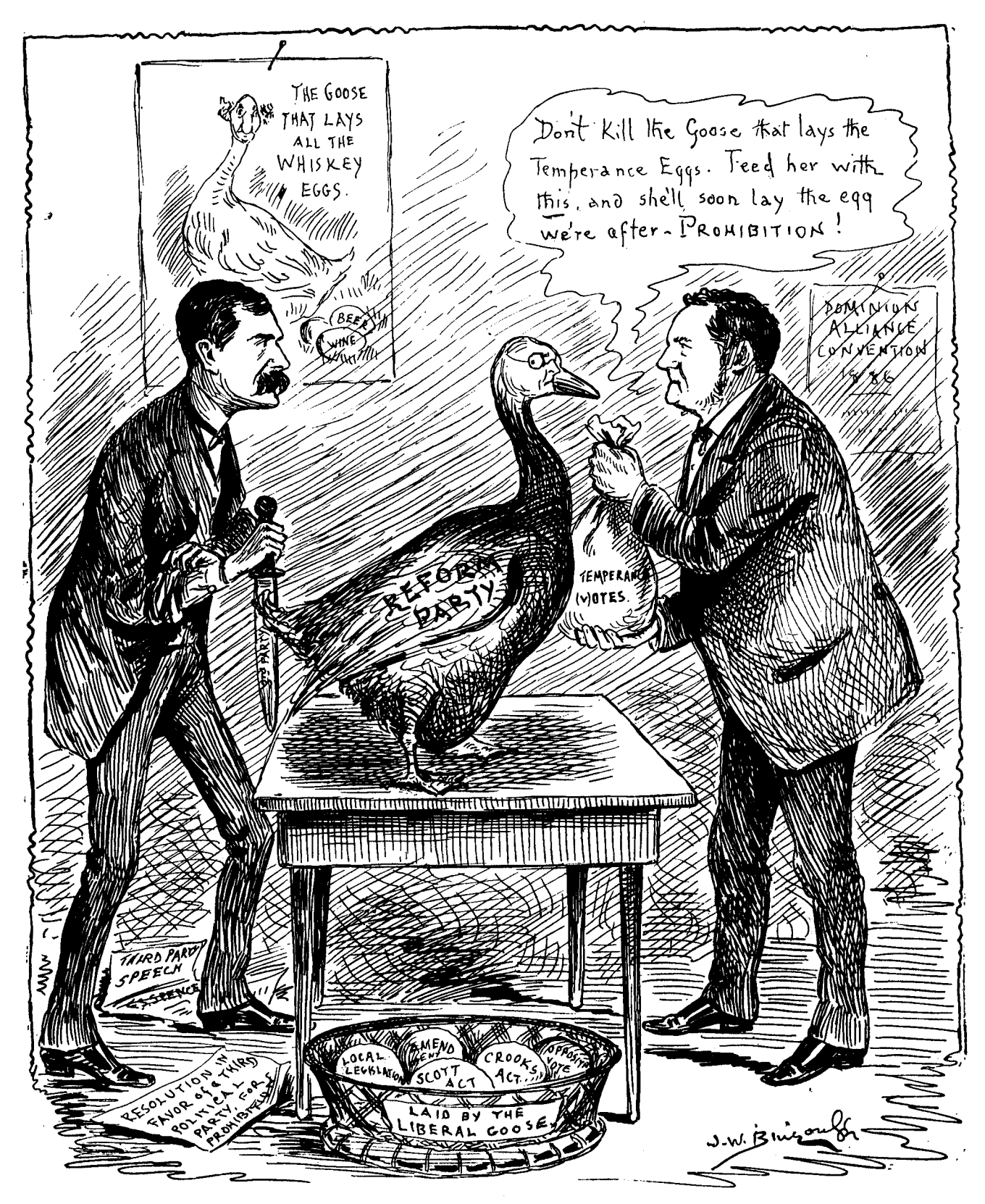
THE REFORM GOOSE ON TRIAL.