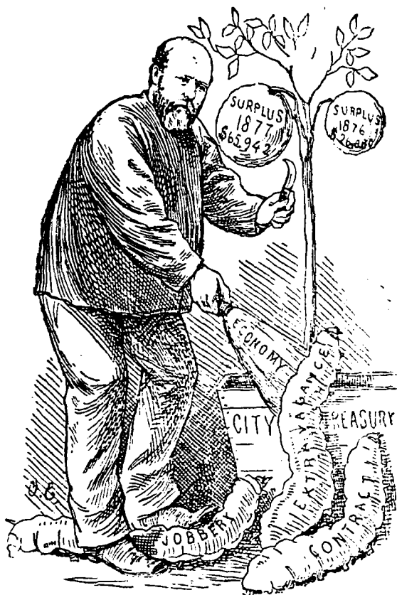
THE CIVIC ORANGE TREE.

GARDENER. (ALD. NELSON): "IF-I-CAN-ONLY-KEEP-OFF-THOSE-VERMIN-I-LL-GROW-A-STILL-BIGGER-ORANGE-NEXT-YEAR."