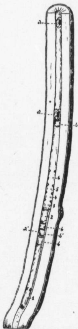
Fig. 8.—a Holes made by woodpecker. a' Id. covered with pieces of resin (b'). b Pieces of resin forming barricade. 1-6 Cells separated by resin partitions.

After this first cell had been constructed, the insect seemed to feel some misgivings concerning the ultimate fate of its progeny, and left unoccupied that section of the tunnel which extended as far as the lowest orifice bored by the woodpecker. Here the wonderful instinct of the bee reveals itself. It placed a first resin stopper just below the level of this aperture, a second one in the hole itself and a third above. The stopper applied to the orifice closes it, but imperfectly, and does not fill the whole tunnel on the inside. But the two other pieces, above and below, are quite cylindrical and close the tube hermetically. All danger of intrusion from below being thus removed, the bee constructed five other cells above this barricade. Once more it did not make use of the whole length of the tube between the two lateral openings, but stopped its work 2.5 cm. below the second hole. A straight