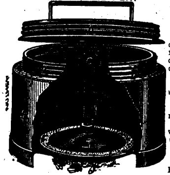
10 lb. 10,50.

The "PERFECTION" having been thoroughly tested, and proved of inestimable value in bee culture, the undersigned, a practical apiarist, is prepared to furnish the same at reasonable prices, and the usual discount to the dealers. Among the many points in which this feeder excels all others are the following. The supply of food can be perfectly regulated. The food will not become ransid, nor sour, and is strained before it reaches the hass