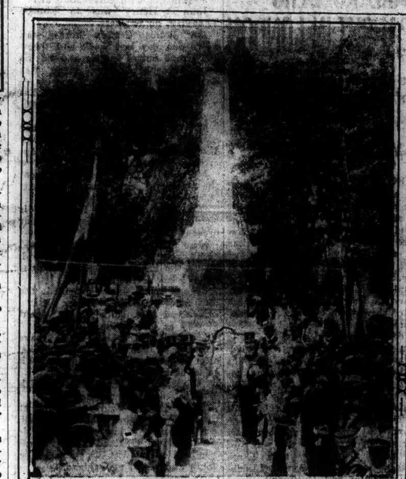
ON THE PLAZA AT MARACAY.

President Gomez demonstrated the strength of the Venezuelan government's military arm when he paraded the entire division stationed at Maracay. A group of twenty political prisoners, who represent the visible residue of the Castro revolution; six thousand infantry, cavalry and mountain howitzers, all well equipped and disciplined, marched from the barracks three miles away, at Tapacana, where the prisoners were taken from Coro.