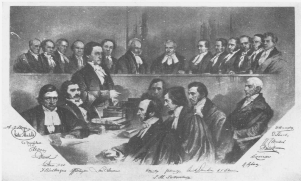
THE SEIGNEURIAL COURT, 1855