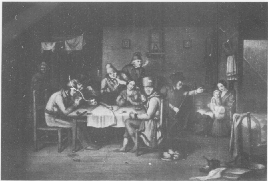
INTERIOR OF A FRENCH-CANADIAN FARMHOUSE