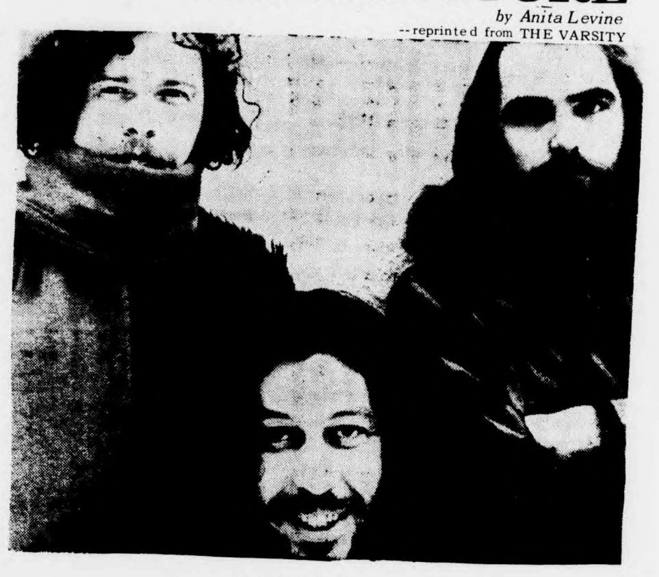
The Fabulous Fugs --

But the most amazing thing about the Fugs is their beauti-