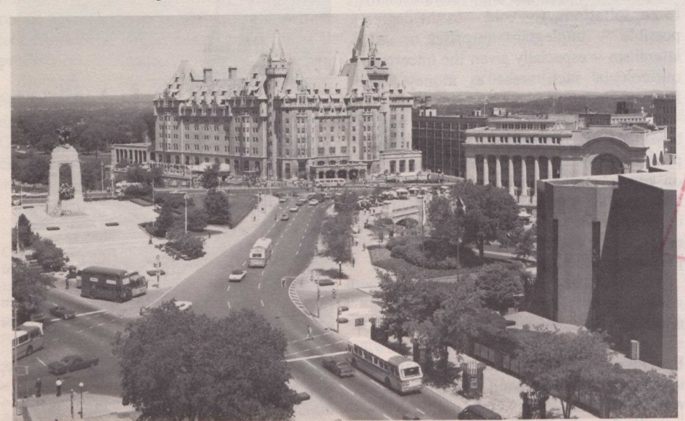
A view of the Chateau Laurier. To the left is Confederation Square and at the right the Conference Centre and the National Arts Centre in Ottawa.

Also arising out of Venice, leaders will have before them the report on North-South issues to which I have alluded al-