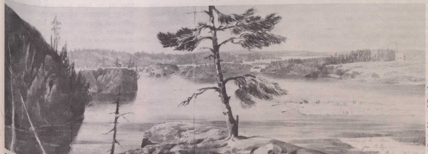
The Outaouais River viewed from the house of Colonel By, at Bytown (now Ottawa), October 18, 1832.

The exhibition will be open to the public until June 30.