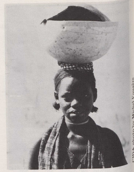
A woman from Niger.

The exhibit, entitled "Women, the Third World and CIDA" was organized to help Canadians better understand the problems in developing countries. It included daily events such as craft displays and demonstrations by artisans, typical food preparation, songs and traditional dances. One country from each continent in which CIDA has projects was featured: Peru, Bangladesh, Montserrat and Niger were highlighted.