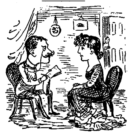
A RUMOR CONTRADICTED.

THE JERSEY LILY IS ONCE MORE INTER-VIEWED.