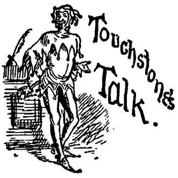
"So the world ways."

It must be rather mortifying to a clever extemporaneous speaker to find a sudden blot, as it were, come over his memory, and his flow of eloquence to be instantly checked from an inability to think of the exact words he wishes to use. This sudden clouding of the memory is by no means uncommon, even amongst the ablest speakers of the day, and I have myself seen a learned minister stopped in the full torrent of his impassioned dis-course by a temporary total loss of mnemonic power. Following is an instance of what I refer to :-