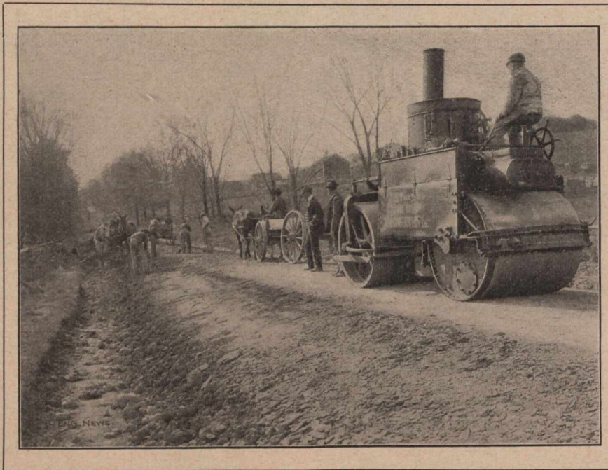
A STEAM ROAD ROLLER AT WORK.

In this way the roads are never without the most careful attention, and expensive and annoying repairs are rendered unnecessary.