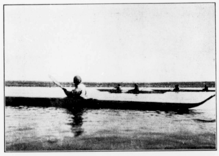
ESQUIMAUX "BOATMEN" ON THE KAZAN RIVER

checked by numerous astronomical observations for latitude and longitude.