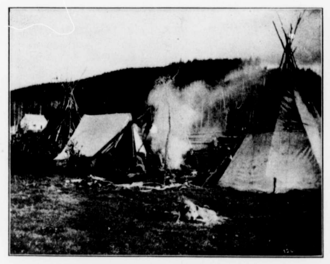
AN INDIAN ENCAMPMENT AT FORT MCMURRAY

once endeavored to proceed eastward on foot, but was obliged to return and wait for the breaking up of the ice, as "the snow thawing made the open country like a lake of open water."