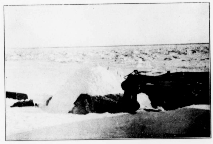
A COMPLETED IGLOO, NEAR CHURCHILL

the fur traders were merely bar-rooms of the very lowest type, where the Indians were encouraged in drunkeness and debauchery of every kind, no alcoholic liquor was allowed to be brought to any