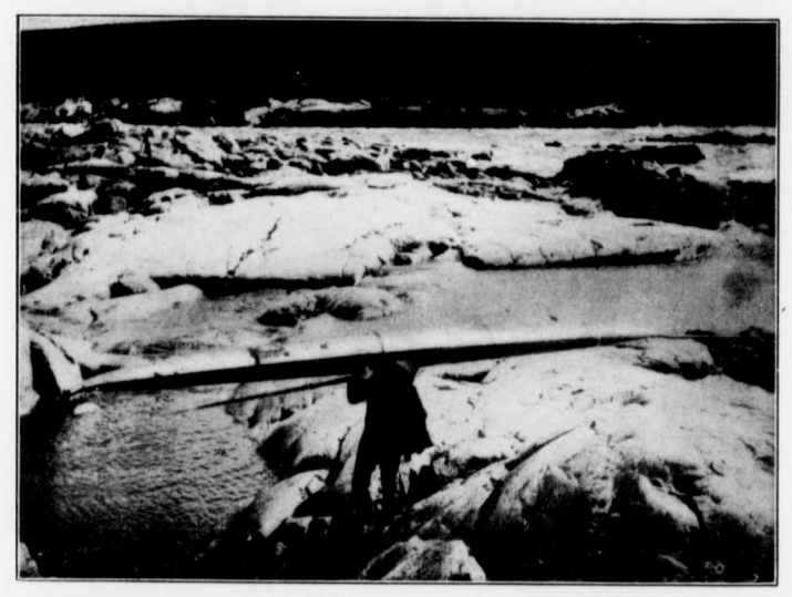
A PORTAGE WITH AN ESQUIMAUX KYACK ON THE KAZAN RIVER ABOVE TATH-KYED FALLS

canoes, on horseback, or on foot, as occasion offered.