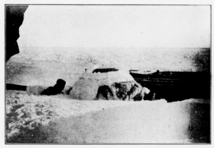
ESQUIMAUX BUILDING AN IGLOO, NEAR CHURCHILL

work was descriptive and general, his was detailed and exact, so that wherever he went others could follow him. They described small portions of the country, he learned of the physical features of all the vast country through which he travelled, and grouped these features together on a map in one harmonious whole, so that not only could any individual course or route of his be followed, but the relations of these courses to each other, their distances from each other and from any other place on the surface of the earth was known for all time to come.