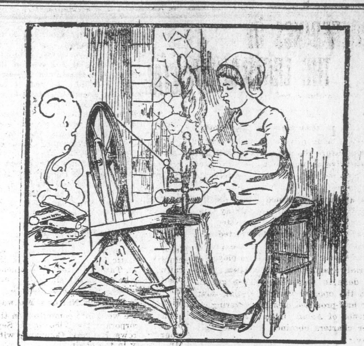
MOTHER GOOSE PUZZLE. Three neighbors are here watching Cross Patch pout and spin. Find them.