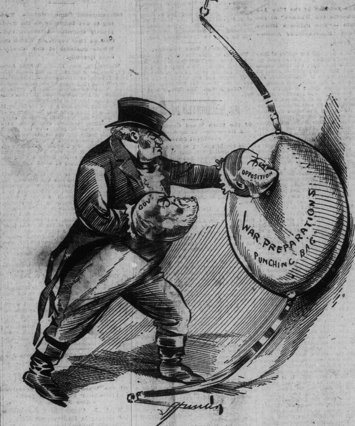
Mr. Bull: Until this 'ere bloomin' 'unknown' signs harticles for a fight, there's nothink like keepin' a feller's self in shape.