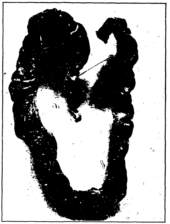
Resection of 4ft. 6in. of Gangrenous bowel.

It then became possible to double clamp and anastomose the