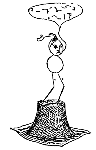
About fourteen minutes later.