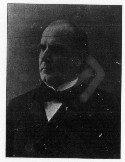
WILLIAM MCKINLEY. LATE PRESIDENT OF THE UNITED STATES.