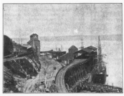
ELEVATOR AND COAL BUNKERS AT TACOMA.

TO many of the delegates to the San Francisco Convention one of the most interesting parts of the trip was the journey along the Pacific Coast from the city of the Golden Gate to Vancouver. Almost everything is different from what we are accustomed in the