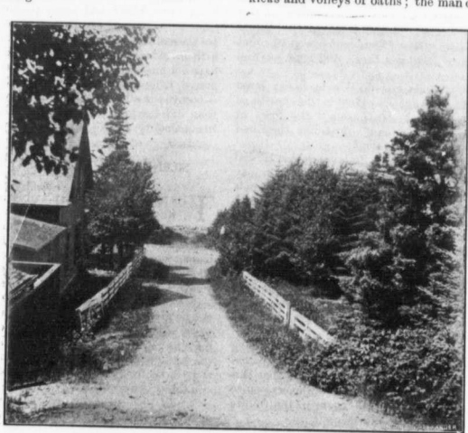
RIVER DE LOUP, ON THE ST. LAWRENCE.

TEACHER: "Describe the route you would follow to get to the Philippine Islands." Pupil: "I'd first proceed to San Francisco." "Well, what then?" "Then I go on board a steamer, and leave the rest to the captain, who knows the ways much better than I do.'