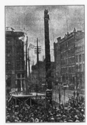
THE SEATTLE TOTEM-PIONEER SQUARE.

purchased for one cent each. In United States territory, fish-wheels are used which, run by the current of the river, have been known to catch thir-