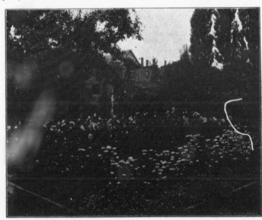
BED OF FLOWERS, IN A TORONTO GARDEN.

the added satisfaction that it has been just as helpful as happy. Anyone who has experimented in seeking happiness will agree that it is found in the highest degree where profit and pleasant companion ship are combined, and also that lasting education is not dull cramming, but that which is combined with recreation. As pleasure is the better combined with instruction, so instruction is the better for the intermixture with pleasure.