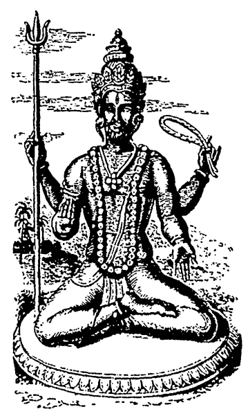
The Hindu God Vishnu.

The glad privilege is given to us to tell these people of a better preserver, who keeps us in life and health; who never leaves nor forsakes; who pardons our sins, and at last receives us to His own home, to be forever with Him.