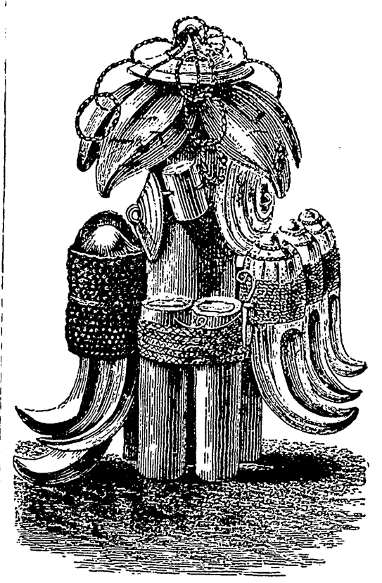
Idol God from Madagascar.

Many a man has buried his manhood in his business. Many a poor slave has dug a deep grave for his soul with the wine-cup for a spade. Fashion has woven the shroud and pall for many a poor girl's soul. In many a garden of beauty and pleasure, hidden among the flowers, is a grave where innocence, faith, purity, virtue, honor, and truth lie buried.—Sel.