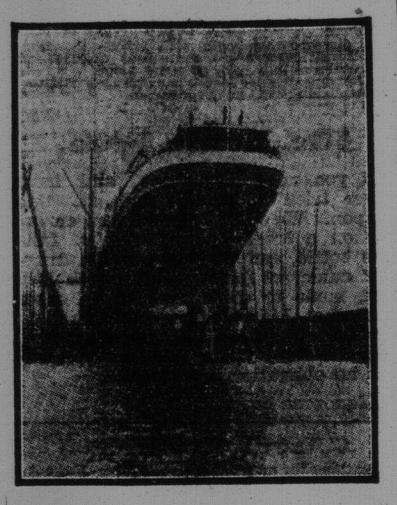
THE VICTORIAN, NEW STYLE.

The Victorian and Her Three Small Propellers Compared With the Oceanic and Her Two Large Ones--Photographs Made While the Great Steamers Were in Dry Dock.