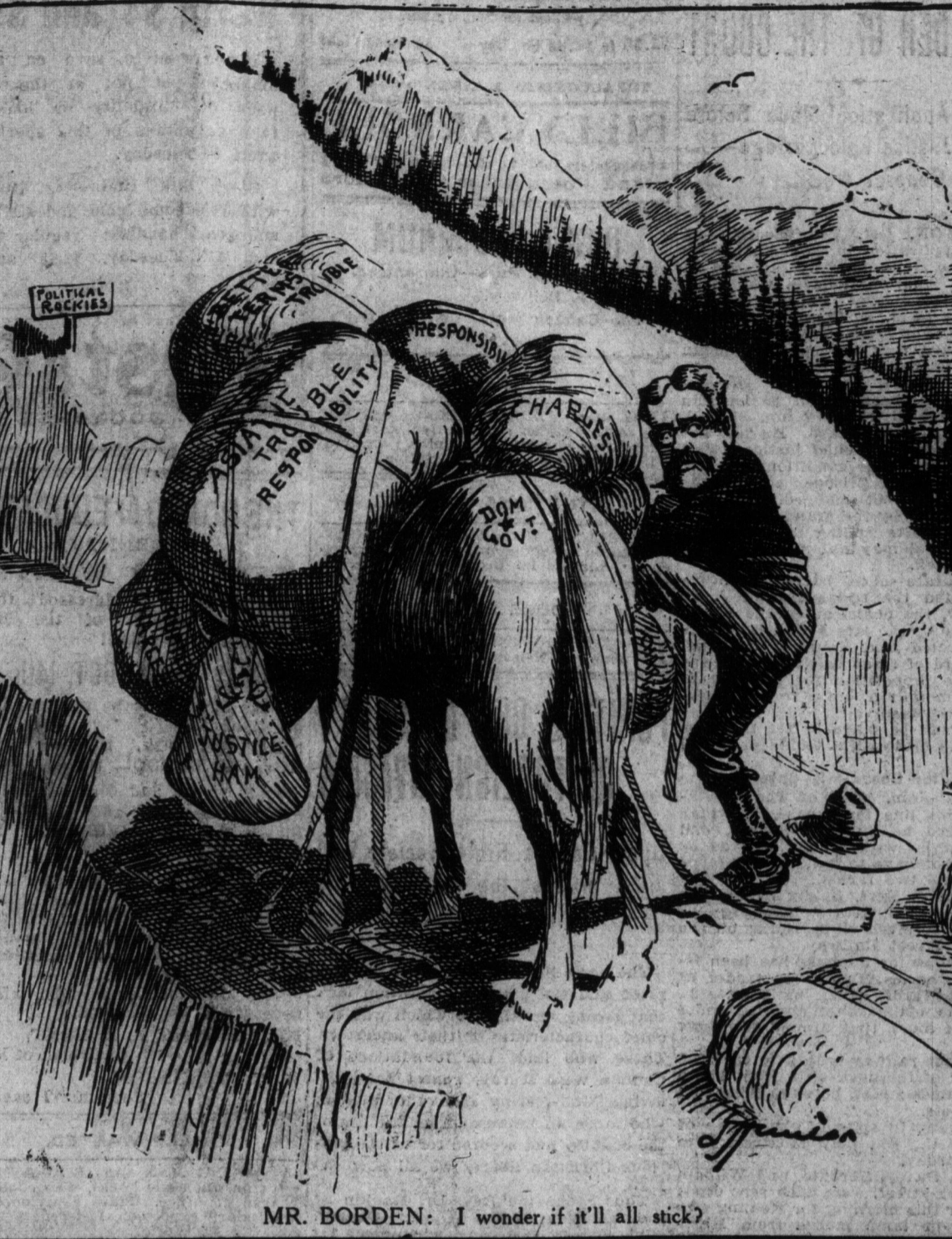
MR. BORDEN: I wonder if it'll all stick?