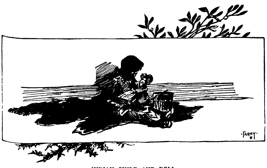
INDIAN CHILD AND DOLL.