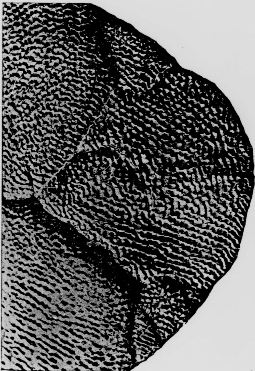
ADOCUS VARIOLOSUS , (Cope). Anterior end of plastron; lower surface; natural size.