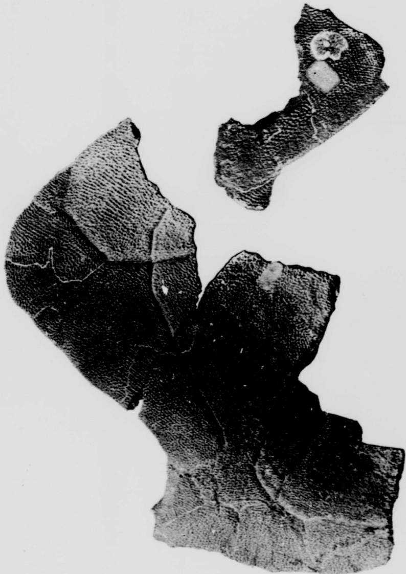
ADOCUS VARIOLOSUS , (Cope). Lower surface of plastron; one-third natural size.