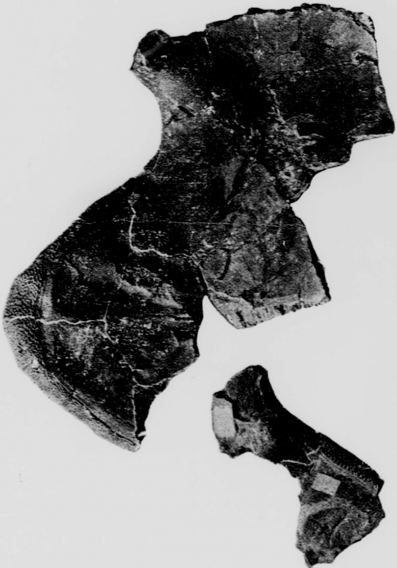
ADOCUS VARIOLOSUS , (Cope).

Upper surface of plastron ; one-third natural size.