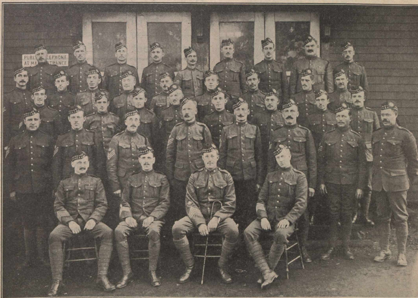
SERGEANTS AND STAFF-SERGEANTS OF 67TH BATTALION

construction are as follows: A detachable magazine (A), loaded with forty-seven cartridges, is attached to a suitable fixing on the barrel near its after end, the first cartridge being fed from the magazine into the firing chamber (B) by the first forward movement of the firing pin, which is, however, arrested before the striker (D) reaches the cartridge unless the trigger (C) is held back. When the trigger (C) is pressed, the striker (D), carried forward by the mainspring (K), explodes the cartridge in the position in the firing chamber (B). Before the bullet leaves the barrel, under the influence of gas pressure, it uncovers a hole (E) connecting the barrel with a cylinder (G) below, lying parallel with it,