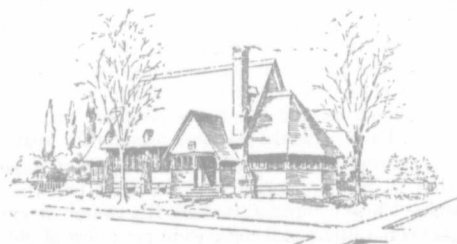
THE NEW CHESTER BAPTIST CHAPEL, DEDICATED NOV. 4TH, 1894.