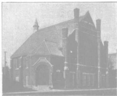
TRINITY CHURCH, GUELPH.