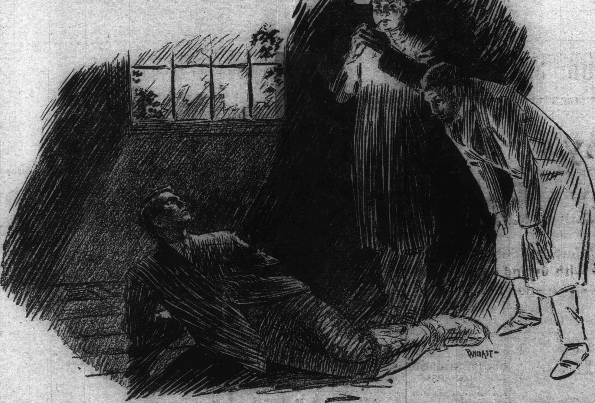
"What shall we do with him?" asked he, in as unconcerned and cool a tone as if they had been discussing the menu of a tea party."