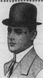
STIFF HATS FOR Easter.

Doors open at 7.30. Performance at 8 o'clock. ADMISSION 10 cents.