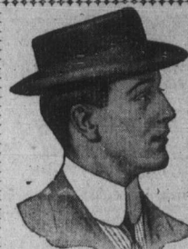
SOFT HATS FOR Easter.

If you need a new suit or overcoat, just a look at our "Clothes of Quality." Designed, Cut and Tailored from the choicest Fabrics by Experts—The Best in the Land.