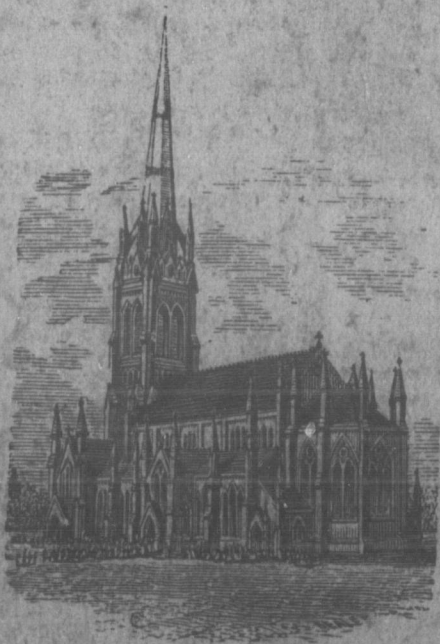
ST. JAMES' CATHEDRAL, TORONTO.