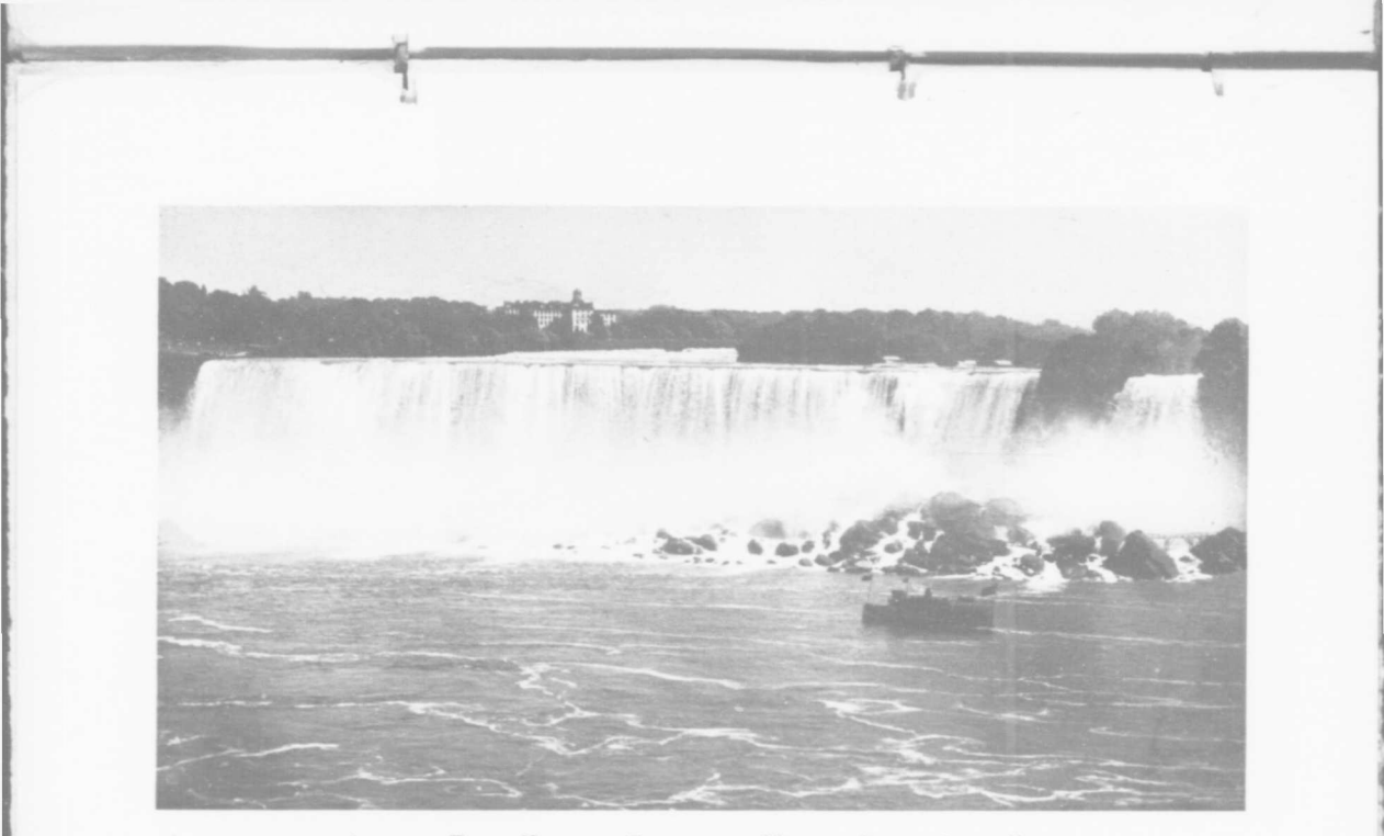
American Fall-Niagara. Cave of the Winds is Behind Small Fall.