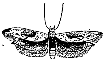
Fig. 1. (x2)

The head and eyes are rather more prominent than the pupa of gallæsolidaginis ; it is also stouter.