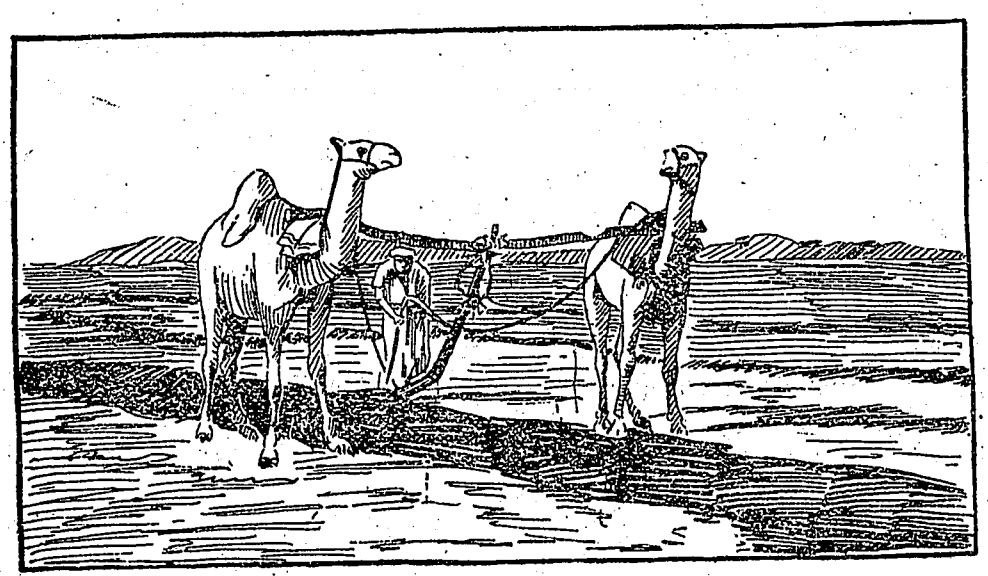
PLOUGHING WITH CAMELS .

There is a hot wind called the simoom, that is an even worse foe to the traveller; for it often kills both men and camels as it sweeps past them.