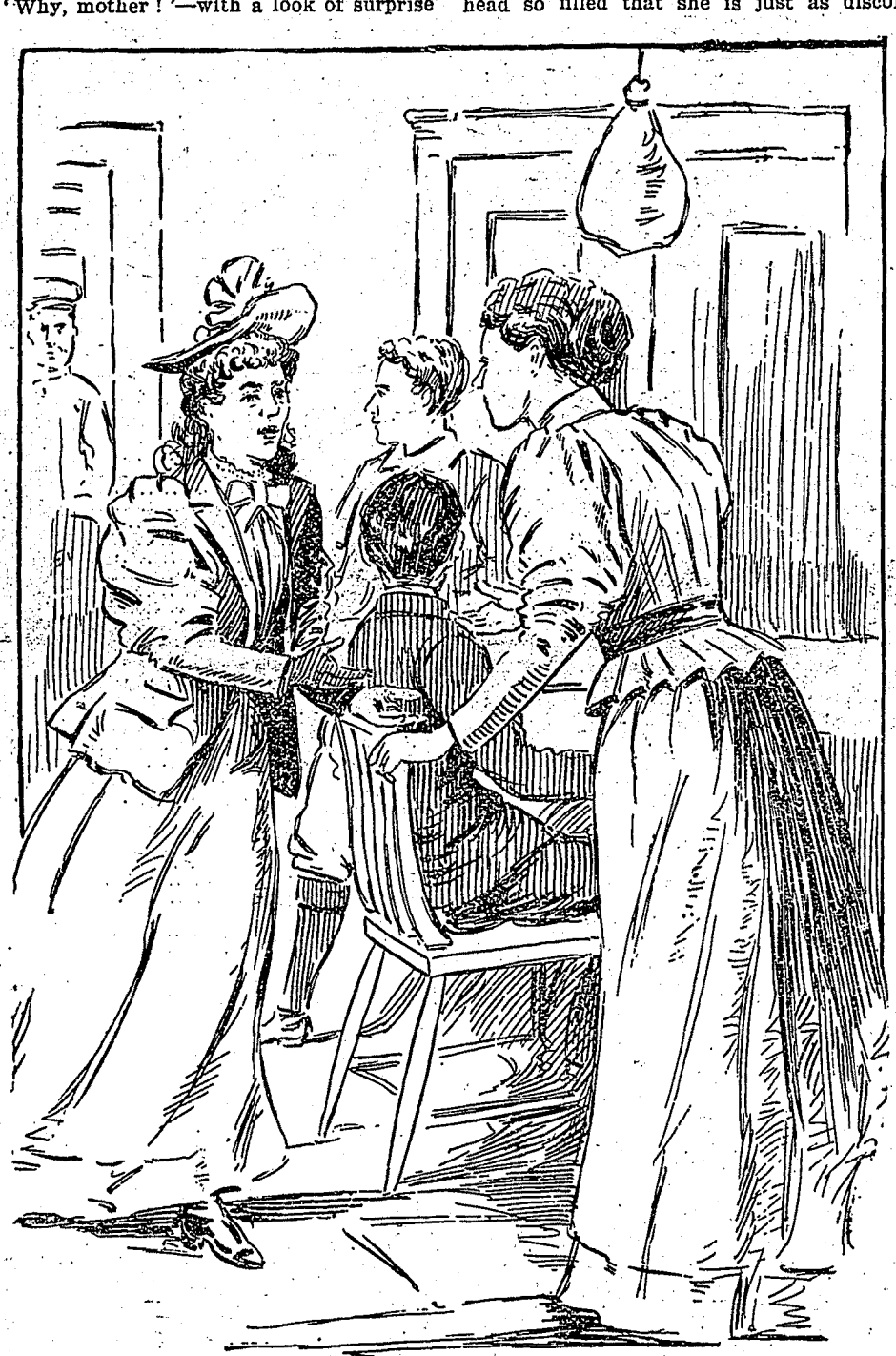
A YOUNG GIRL CAME HURRYING INTO THE ROOM.

The only religious instruction great many children have is in the Sunday-school. They come from homes where Christ is not known. This makes the work of the teacher very responsible.