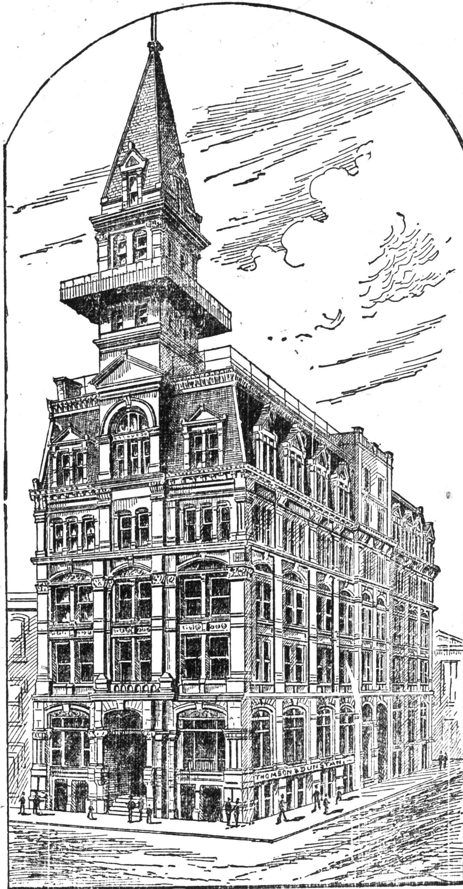
Head Office--Mail Building.