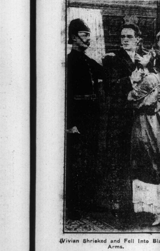
(Vivian Shrieked and Fell Into Blair's Arms.

THE deer head dropped from my hand at the lower part of the neck to the ground as the by a hinge. A little puff of dust marked the breakaway, and from within the hollow neck a package of yellow parchment, with faded tape, fell to the floor. Stryker picked it up and saw the annotated in ancient angular handwriting, the ink faded to rust color as he scanned the faded markings.