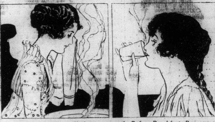
Always Wash at Night.

FEW of us realize the value of the simple beauty aids which are always close at hand. We are willing to pay extravagant prices for preparations that will improve our complexions, yet scorn to use nature's remedies because they are "too cheap."