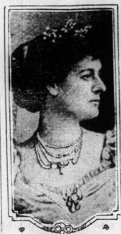
COUNTESS MARKIEWICZ, whose husband is a Polish artist, was captured among the Dublin rebels. It is said she shot and killed a guard in front of her Dublin castle. For several years she has been an ardent militant and Sinn Feiner.