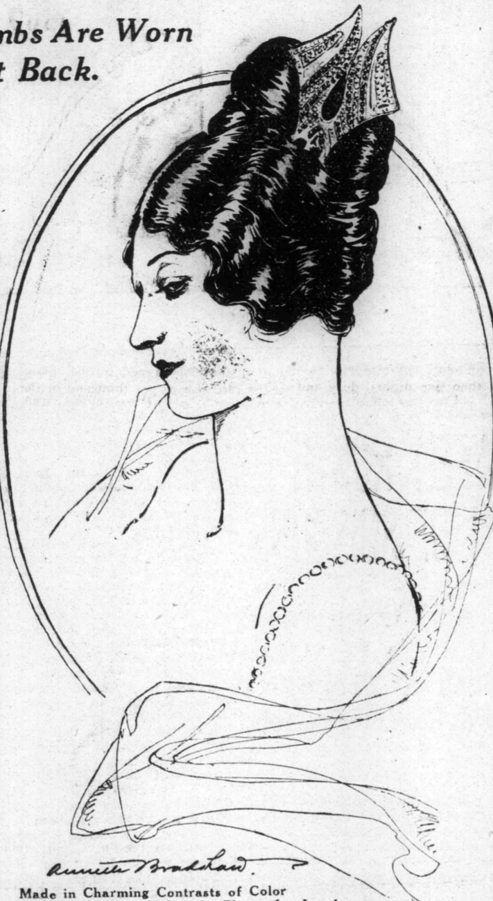
Made in Charming Contrasts of Color This Comb Often Takes the Place of a Jewel.