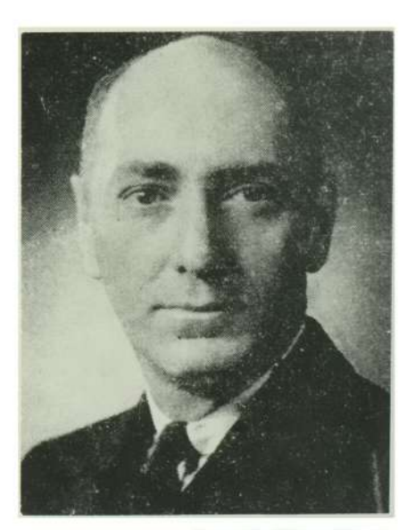
Newfoundland Historical Society