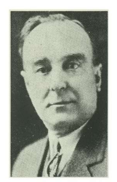
Newfoundland Historical Society