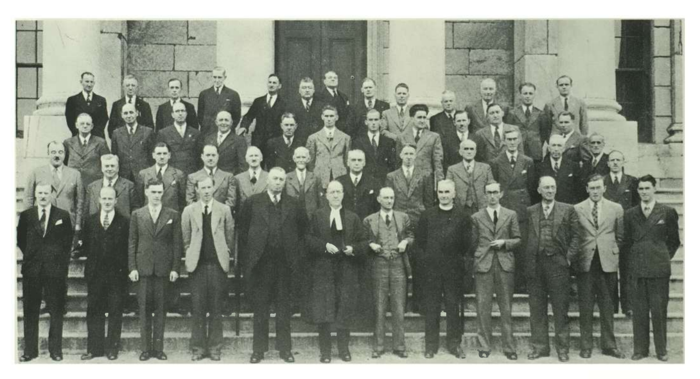
Book of Newfoundland, Vol. III