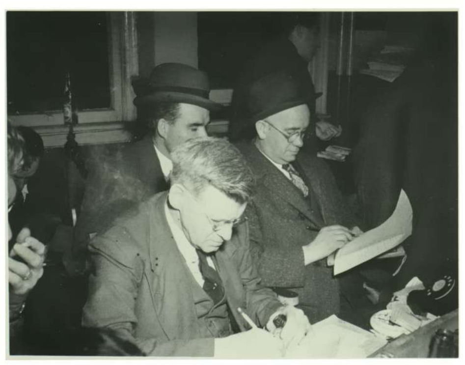
Provincial Archives of Newfoundland and Labrador