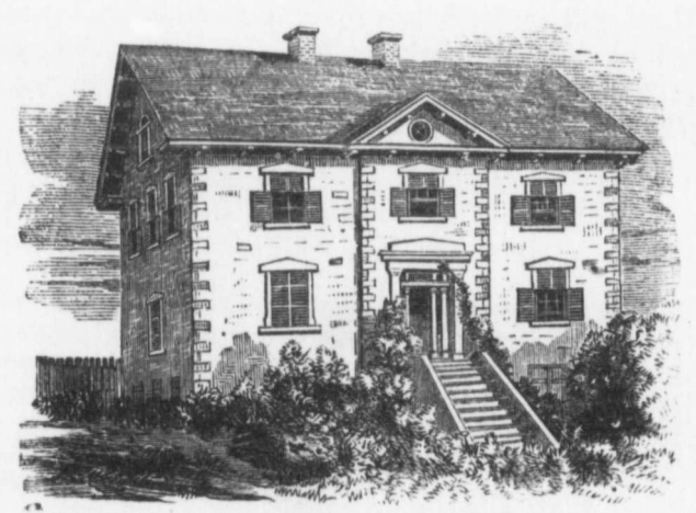
GIRL'S SCHOOL, POINTE AUX TREMBLES.