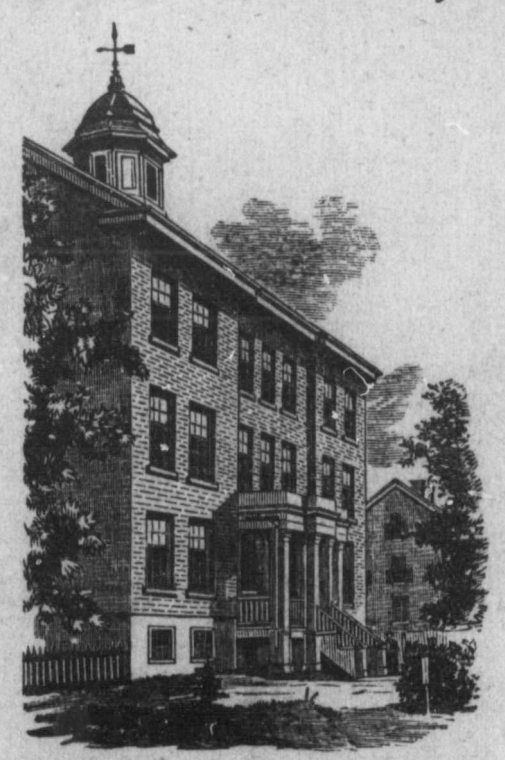
BOY'S INSTITUTE, POINTE-AUX-TREMBLES.