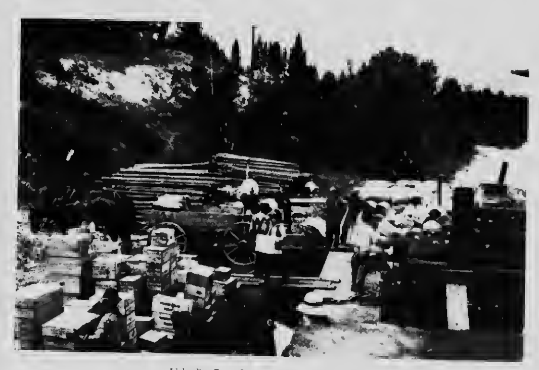
Unloading Camp Supplies on Company's Property

The property is also offered uncleared, or the Company will clear, fence, plant and care for the property for absentees or those desiring to remain away totally or temporarily until the producing stage is reached.