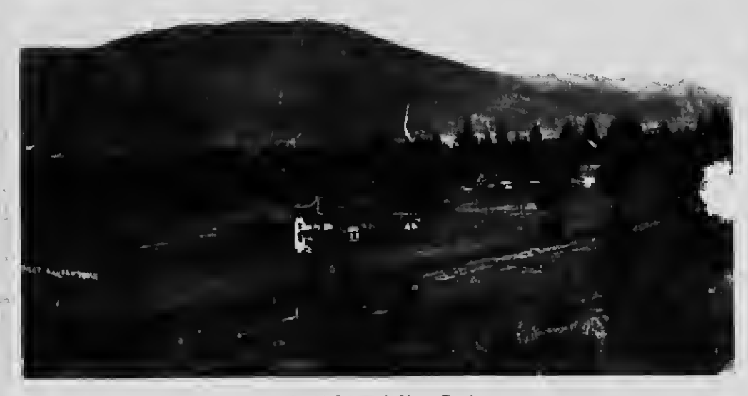
View of Company's Upper Ranch

"Hops used only as ornamental climbers grow so rapidly that one cannot help thinking that if there were any means of disposing of them and anyone with the necessary capital, it would be a very paying proposition to grow them on a commercial scale.