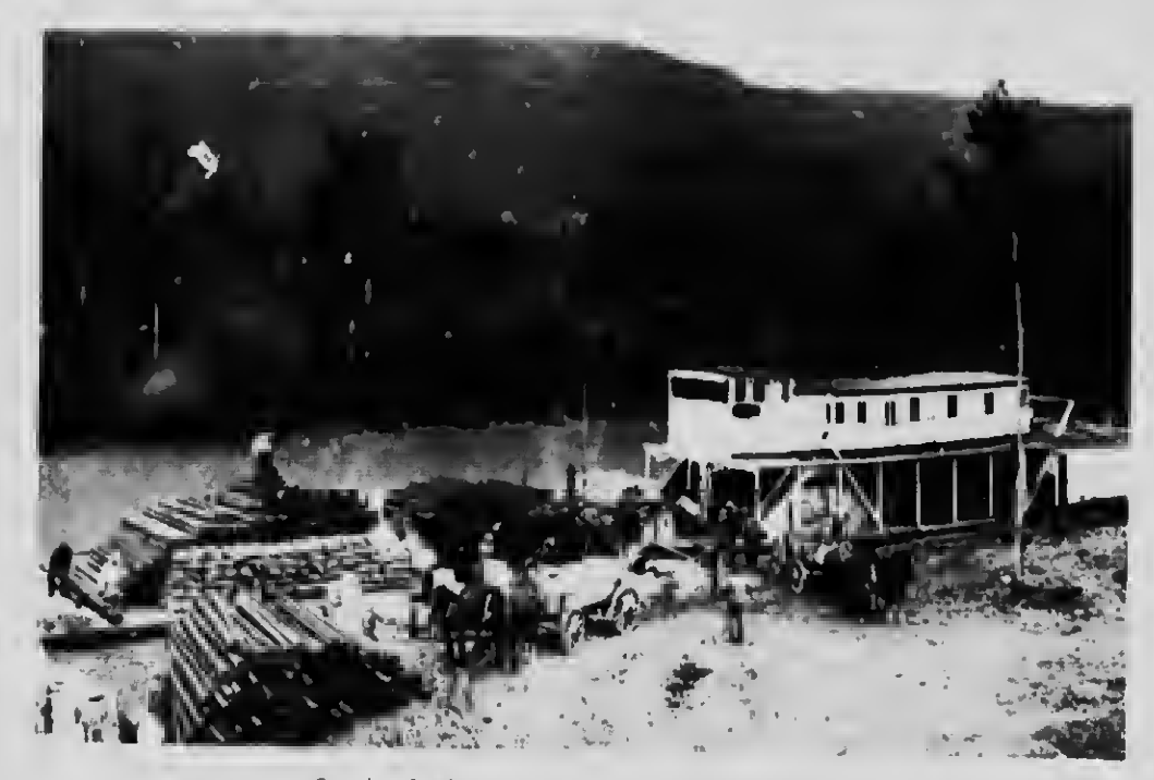
Steamboat Loading on Company's Property-Columbia River

For further particulars write for Special Booklet on the matter.