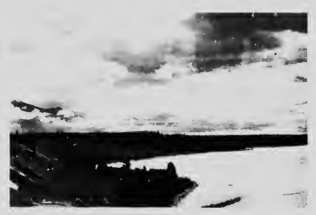
View of Section of Lake Windermere

Such a place, such an opportunity is afforded by fruit and market gardening in land offered by Columbia Valley Orchards Limited.