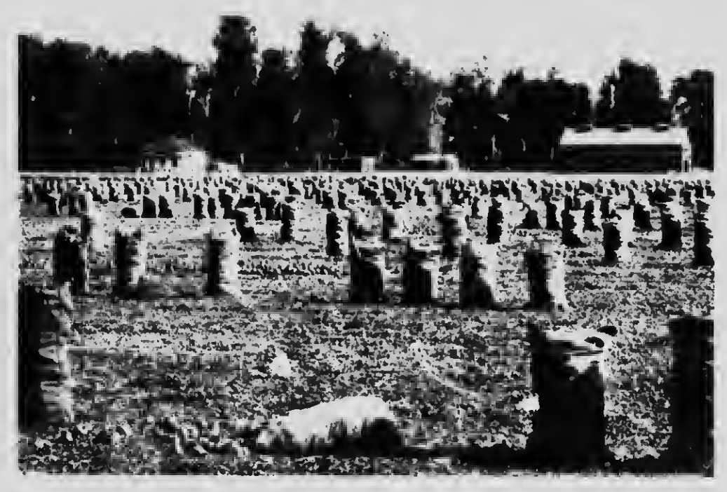
This British Columbia Irrigated Farm produced Onions last season from 5 acres, which sold for $4,500

Where children might grow to sturdy manhood and womanhood in a home surrounded by real comfort and only good influences.