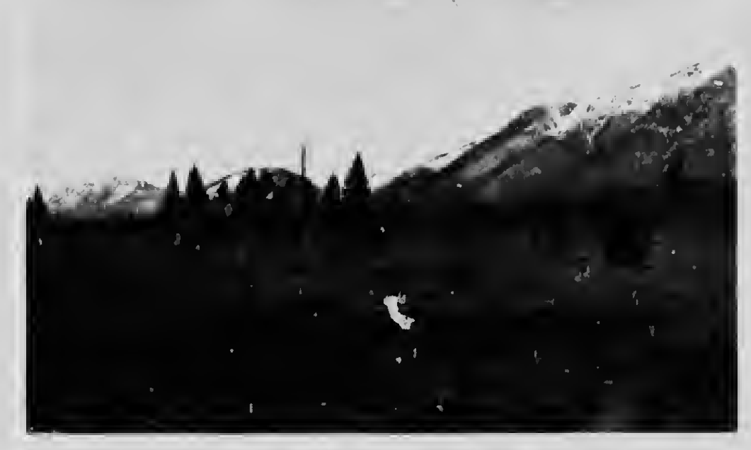
Park-like Appearance of Some of the Company's Lands

In summing up—Bulletin 26, issued by the Legislative Assembly of British Columbia, says: