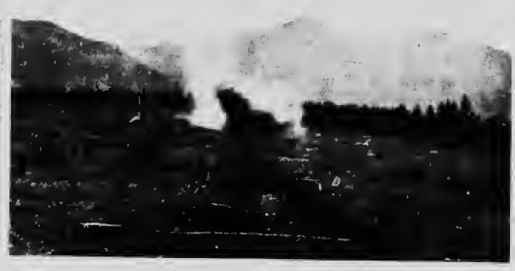
Land Clearing Operations Shooting Stumps

He recognized that the scenery, climate and soil were of such a nature as to make the land most desirable as soon as transportation facilities were furnished. He anticipated that a railway would be built almost immediately. He purchased from the Government a large tract of land of what he considered the most desirable and decided to await the advent of the railway.