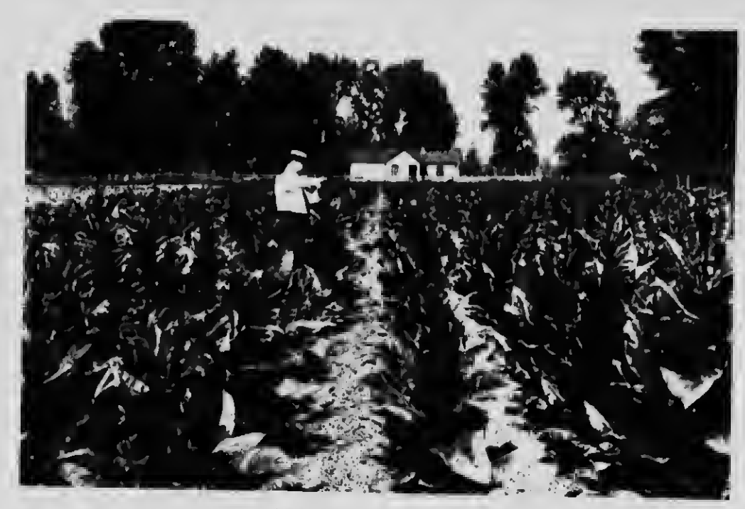
Tobacco Growing in British Columbia

Fruit land of similar character and in the same valley in the United States sells at $1000 to $1500 per acre, while developed orchards sell at prices easily double those mentioned.