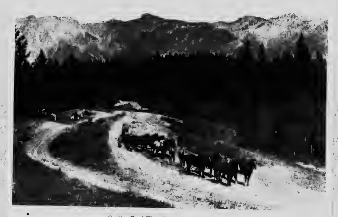
Grading Road Through Company's Headquarters

The climate can probably not be better explained than by quoting from Bulletin No. 26, published by authority of the Legislative Assembly of British Columbia:—"The climate is