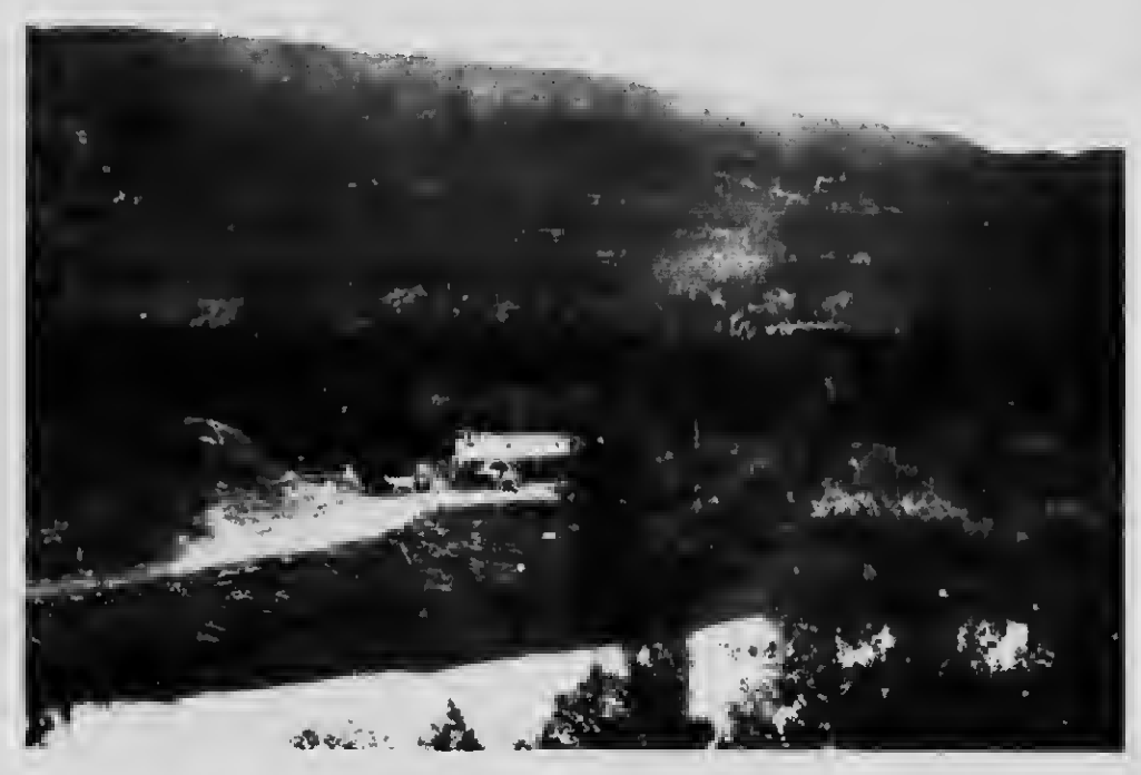
View of Steamboat Landing on Company's Property

While fruit growing in this valley is beyond the experimental stage, yet it has not yet reached that development which makes the cost of land almost prohibitive, as is the case in the same valley further south in American territory.