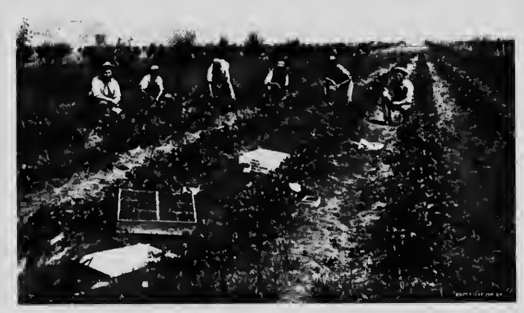
Harvesting Strawberries in British Columbia