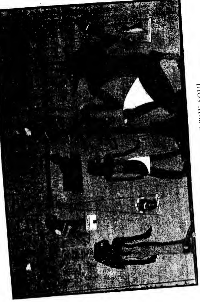
THE WEIGHING OF THE SOUL

BY ANUBIS AGAINST LAW SYMBOLIZED BY A FEATHER. (From the British Museum fac simile.)