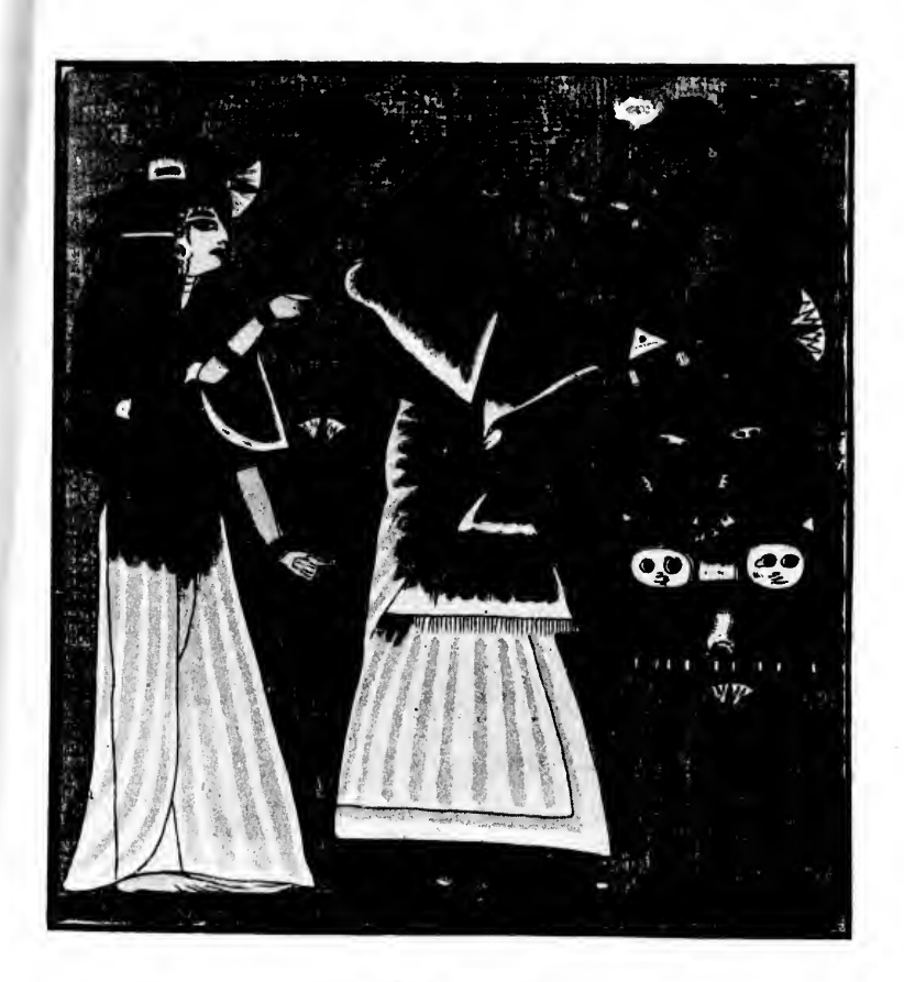
ANI AND HIS WIFE BEFORE A TABLE OF OFFERINGS. (From the British Museum fac simile.)