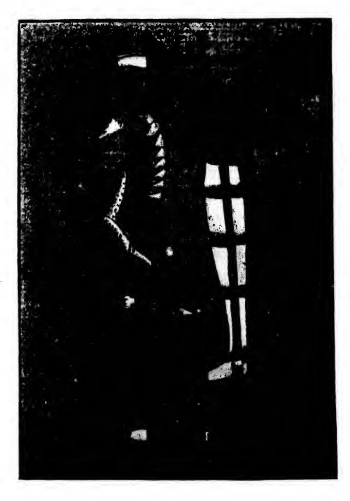
THE SOUL OF ANI VISITING HIS MUNMIFIED BODY. (From the British Museum fac simile.)