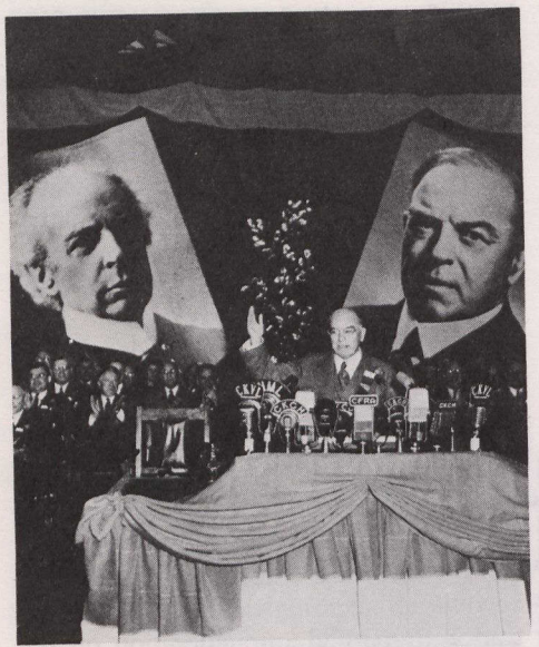
Prime Minister Mackenzie King addresses the national Liberal convention, 1948.

Internal events throughout 1948 were dominated by Canada's continuing financial problems, the entry of Newfoundland