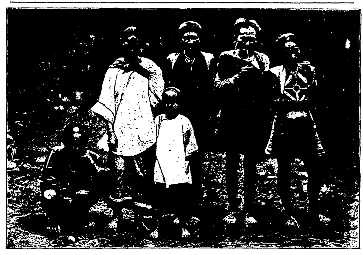
Unsubdued Aborigines Living in the Mountains.