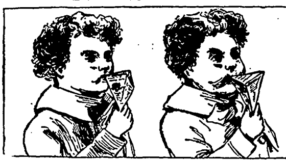
PYRAMID MISSIONARY BOXES.

"Oh, I know —" and then checked herself as suddenly as if she didn't really want to know at all.