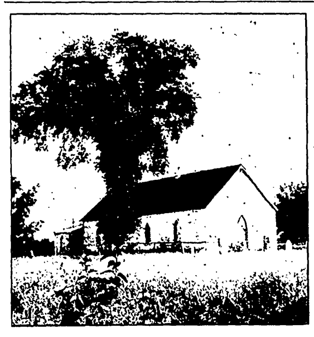
ST. PETERS CHURCH, RED RIVER RESERVE.