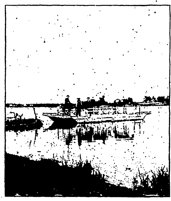
FERRY SCOW, RED RIVER.