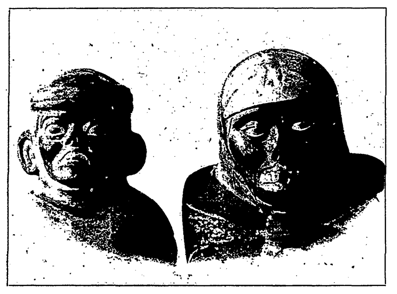
Field Columbian Museum Collection.

Here are two Peruvian photographs (Fig. 1) sent by Dr. Dorsey. They are unpublished, and represent Huacos pottery from Chimbote. The deformations are the same as those represented in some of my figures to the Berlin Conference: Soft part of the nose gone, septum showing that there has not been any falling in of the