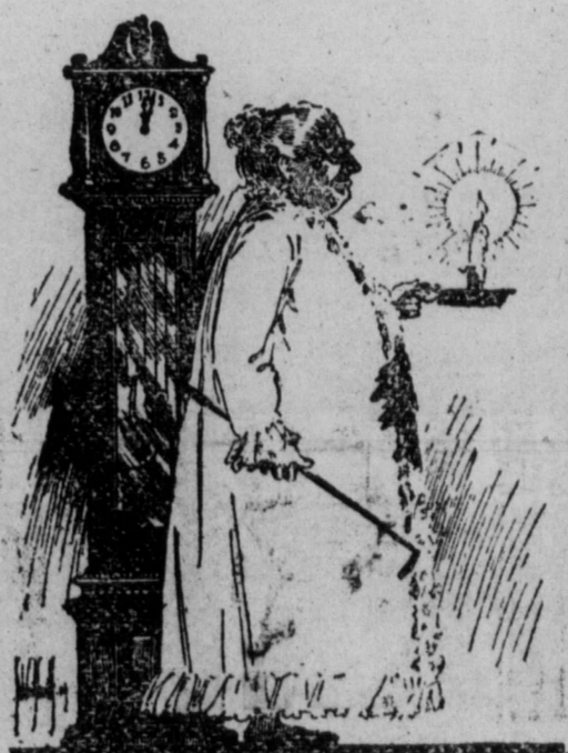
Waiting for the Late male.—Life.