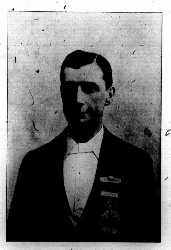
always fraternally P. F. F. Suffatuck